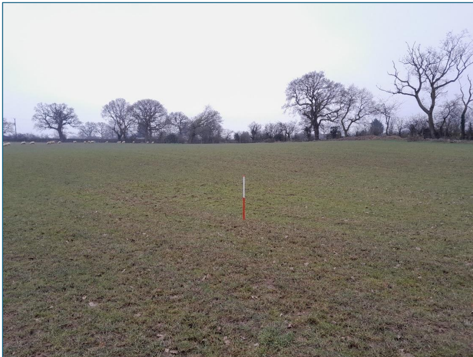
Plate 18: SW facing shot showing large depression towards the SW of the CAA