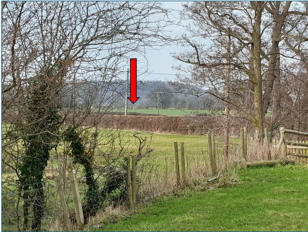
Plate 3: NW facing shot showing WAA from Asset 3 (Wat's Dyke)