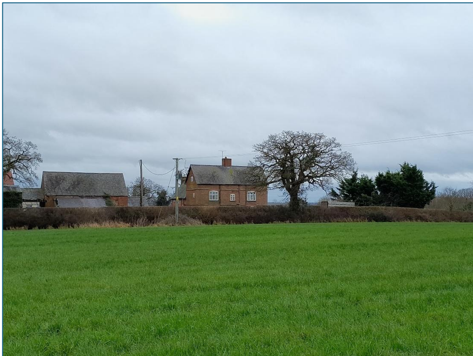
Plate 24: SW facing shot showing Assets 79 and 208 from NW of the CAA