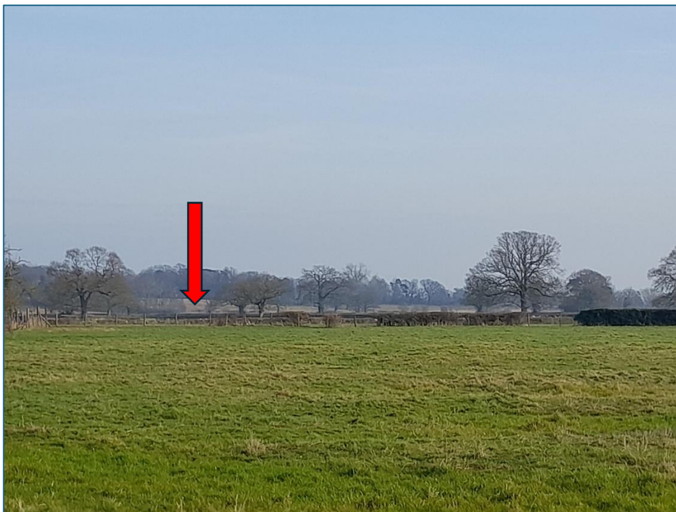
Plate 8: NW facing shot showing potential intervisibility with the EAA from Asset 112