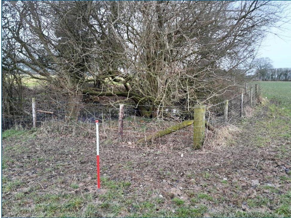
Plate 17: SW facing shot showing pond (Asset 791) towards the SW of the CAA