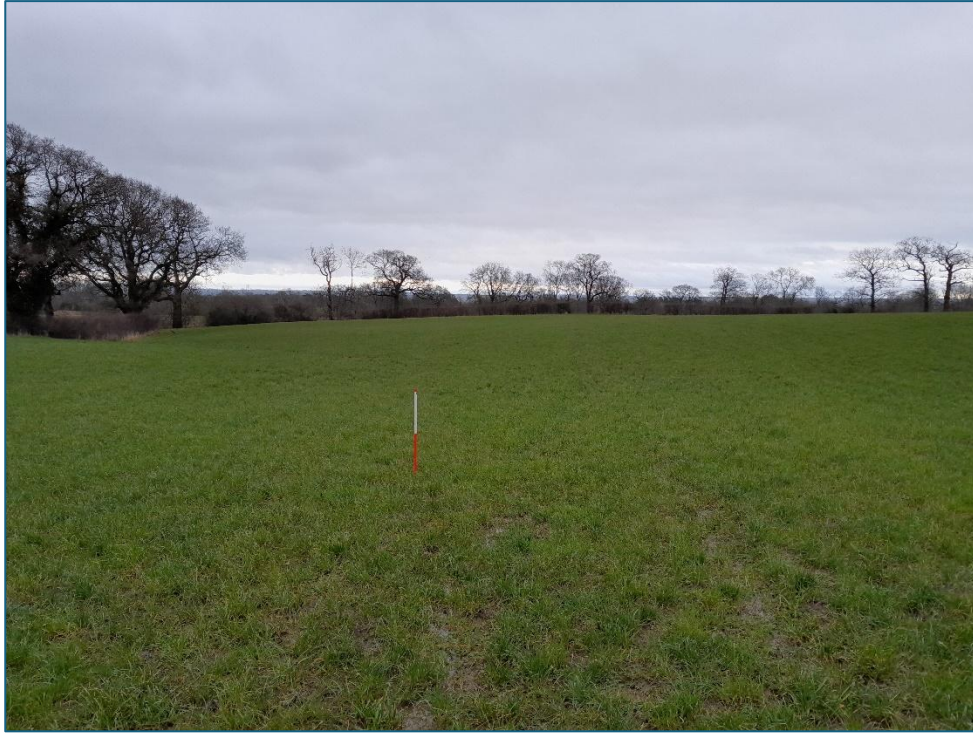
Plate 19: E facing shot showing large depression towards the S of the CAA