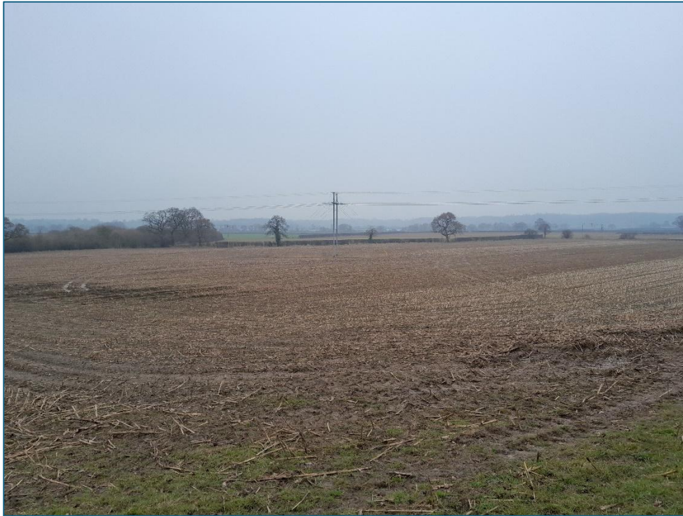
Plate 25: S facing shot showing general view from S of the EAA