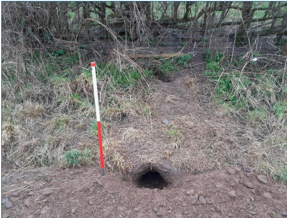
Plate 26: NW facing shot showing animal burrow towards S of the EAA