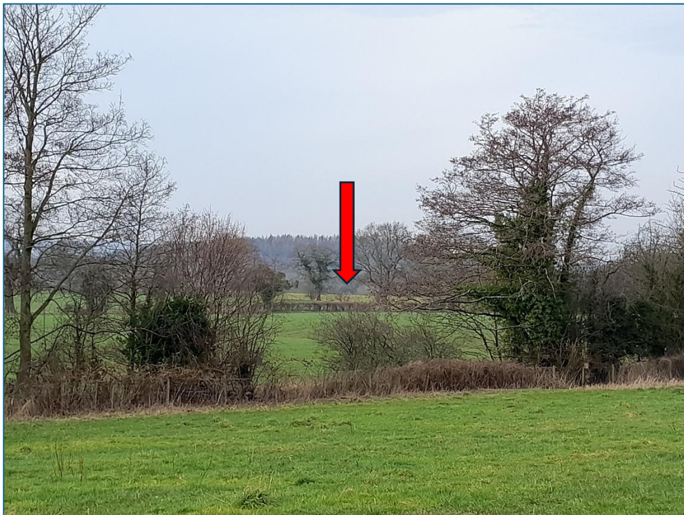
Plate 2: NW facing shot showing WAA from Asset 35 (Wat's Dyke)