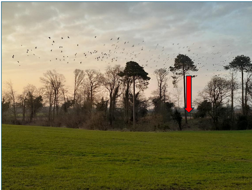
Plate 10: S facing shot showing potential intervisibility with the CAA from Assets 79 and 208