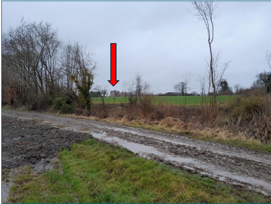
Plate 21: NW facing shot showing Assets 79 and 208 from SW of the CAA