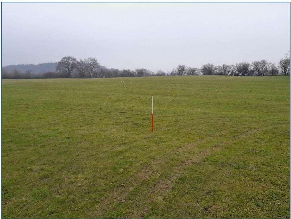
Plate 12: N facing shot showing ridge and furrow towards the centre of the WAA