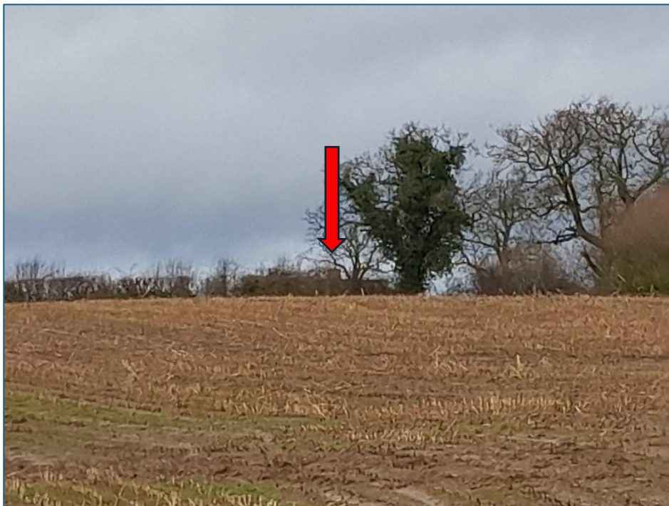
Plate 22: W facing shot showing chimney of Assets 79 and 208 from S of the CAA