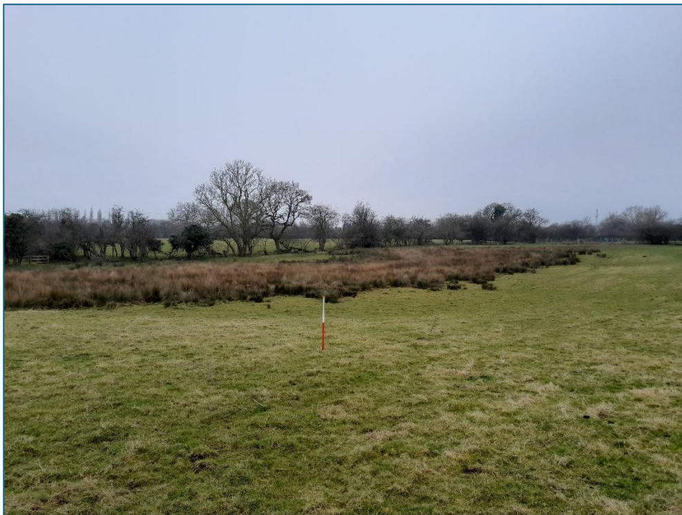
Plate 16: SW facing shot showing water-logged area towards the N of the WAA