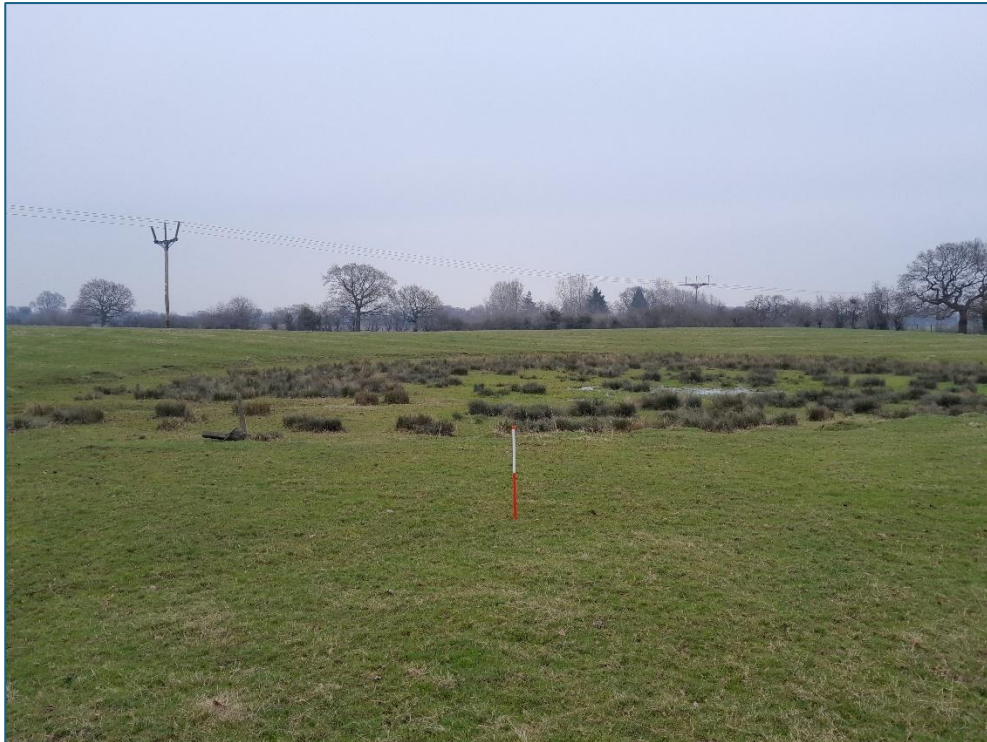
Plate 13: SE facing shot showing water-logged area towards the centre of the WAA