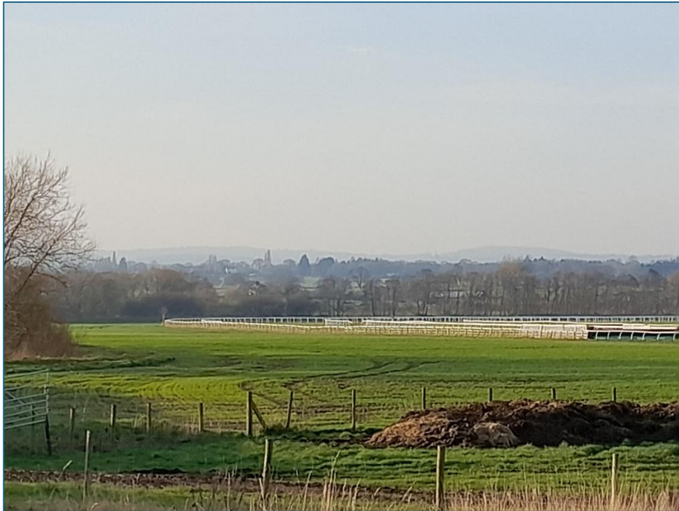
Plate 7: NW facing shot showing potential intervisibility with the EAA from Asset 88