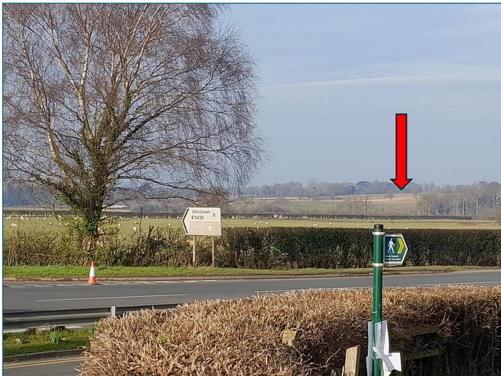
Plate 6: WNW facing shot showing potential intervisibility with the EAA from Assets 41 and 58