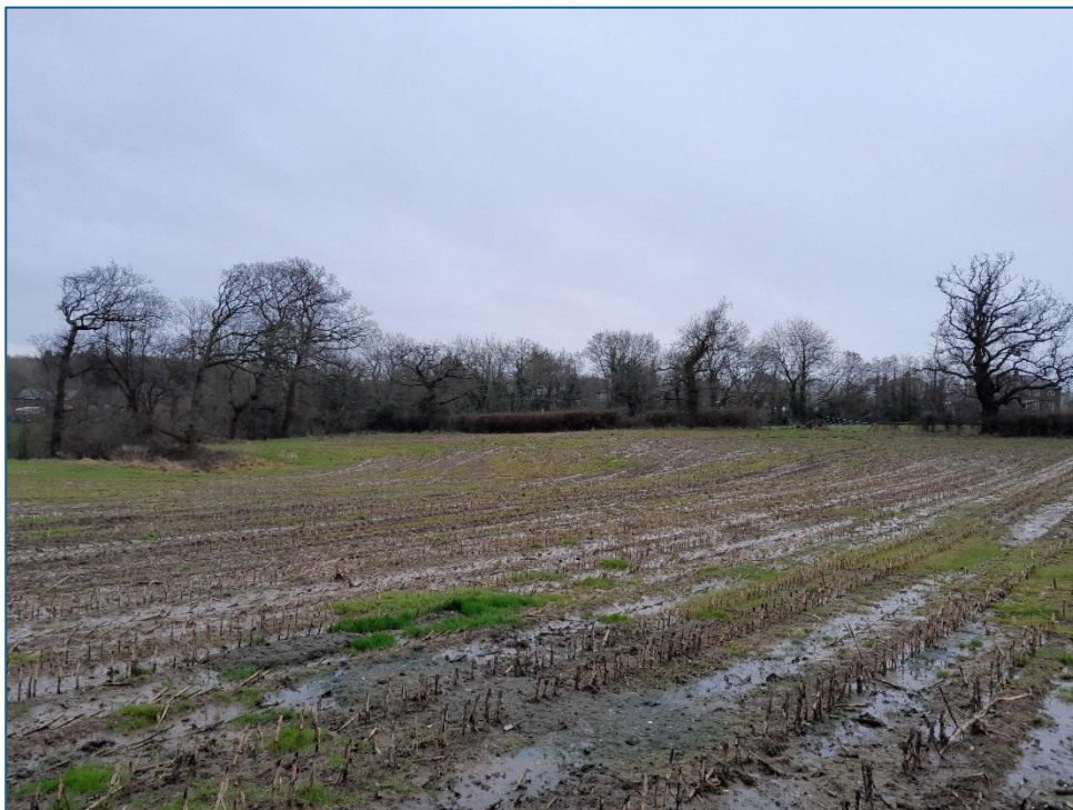
Plate 20: SE facing shot showing large depression towards the SE of the CAA