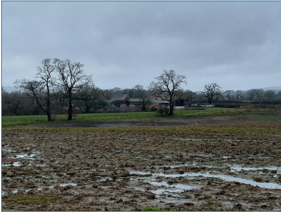
Plate 23: SW facing shot showing Assets 79 and 208 from NW of the CAA