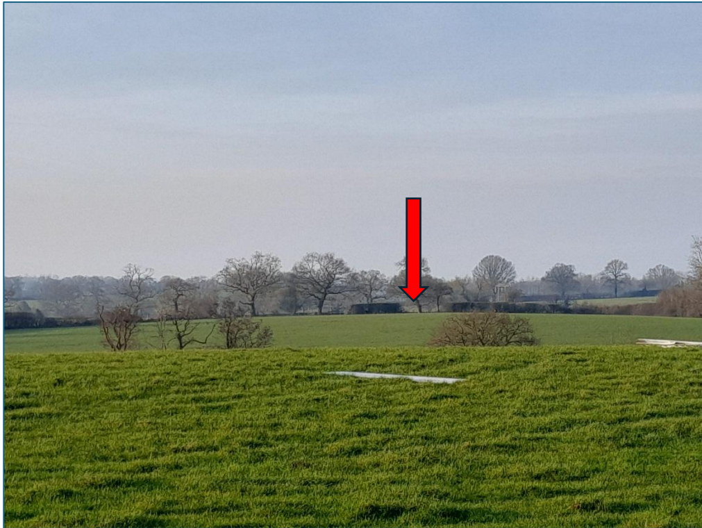
Plate 9: SW facing shot showing potential intervisibility with the EAA from Asset 177