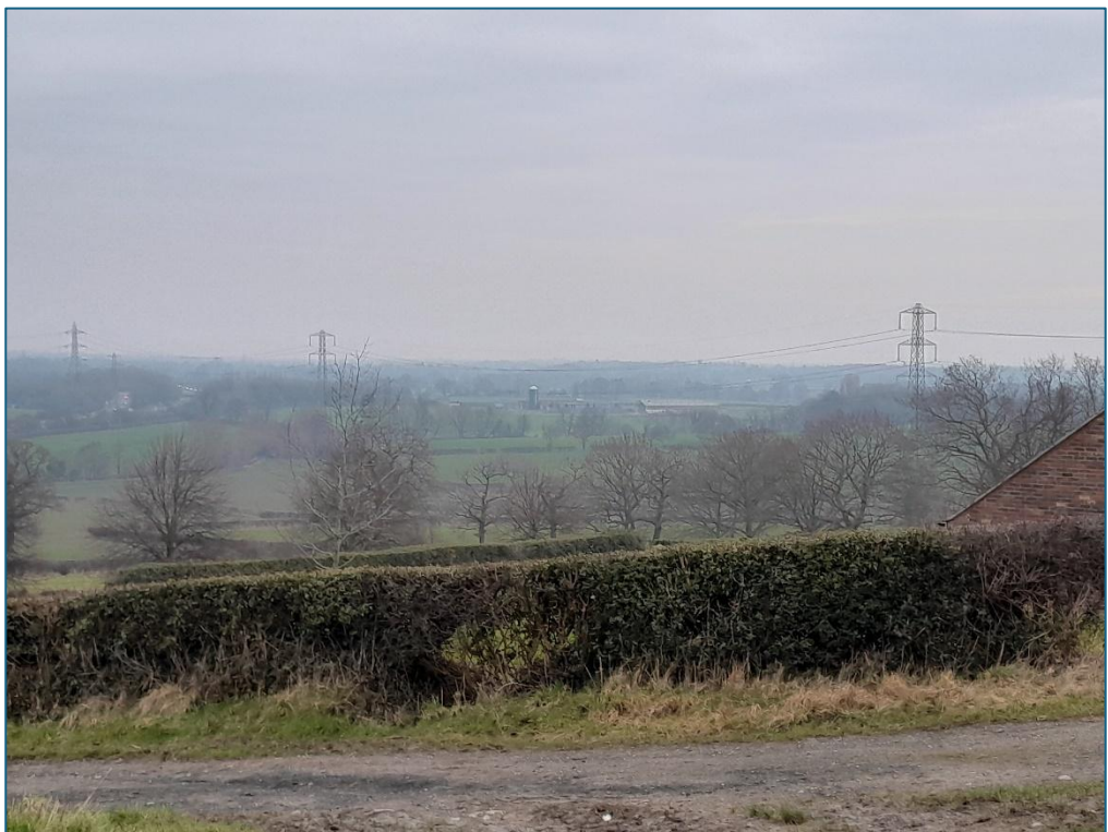
Plate 4: N facing shot showing potential intervisibility with the WAA from Asset 25 (Wat's Dyke)