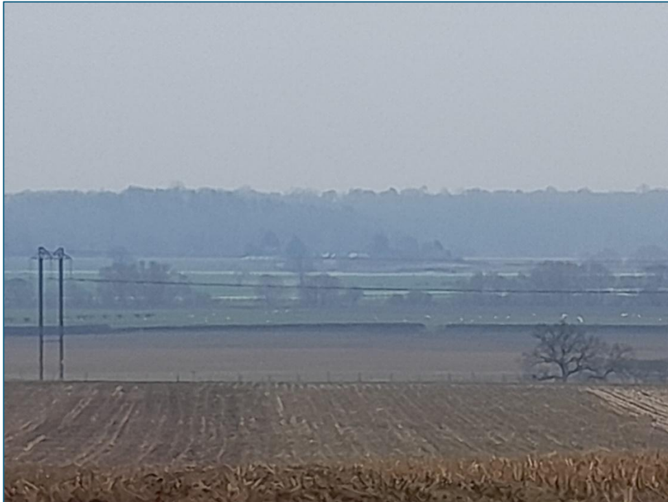
Plate 27: S facing shot showing Bangor-On-Dee Racecourse and potentially Asset 88 from NE extent of the EAA