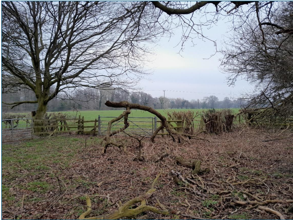
Plate 11: SE facing shot showing Wat's Dyke (Asset 35), from SE extent of the WAA