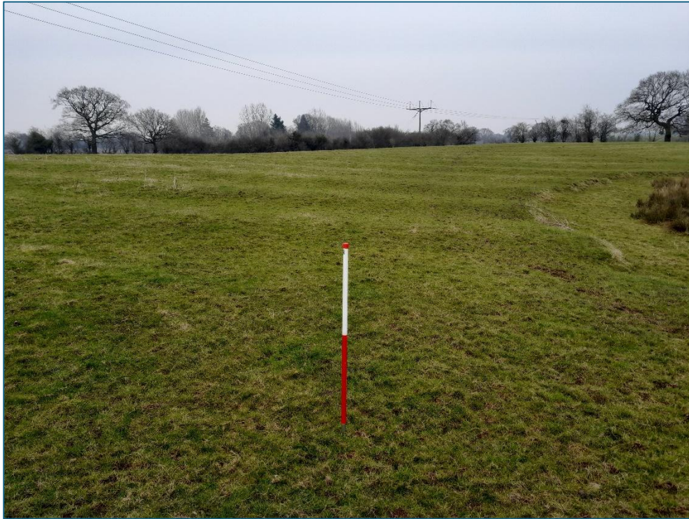
Plate 15: SE facing shot showing ridge and furrow towards the centre of the WAA