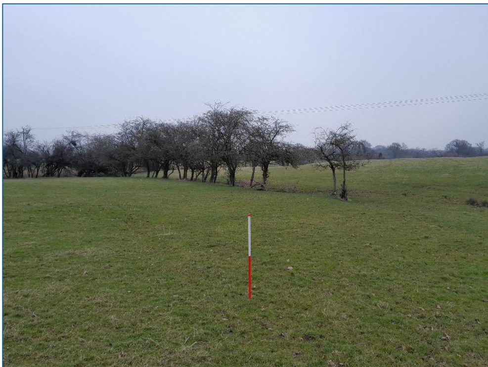
Plate 14: NE facing shot showing a possible previous boundary towards the centre of the WAA