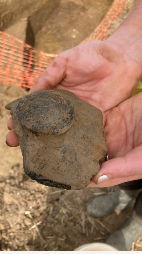
A ceramic pot lid, most likely 'greyware' of Roman date