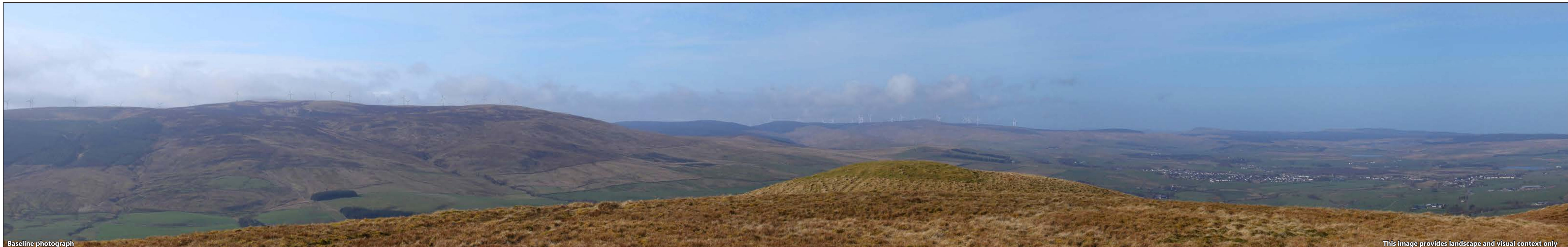
Baseline photograph This image provides landscape and visual context only

H:\Data\Projects\38388 SUB - Monquhill Wind Farm\04\Drawings\2023\Enoch Hill 2\Figure 9.31a - c\VP10_Corsencon 852398-WSPF-FG-SA-00033_R2.indd Originator: wis03