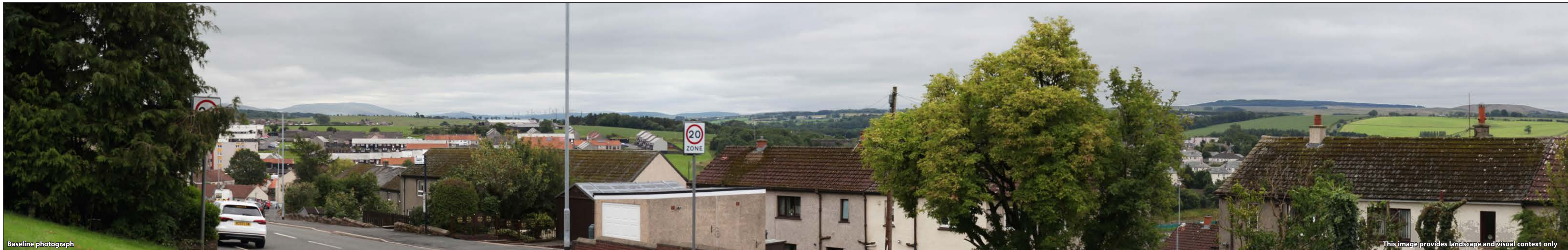
Baseline photograph This image provides landscape and visual context only

H:\Data\Projects\38388 SUB - Monquhill Wind Farm\04\Drawings\2023 Enoch Hill 2\Figure 9.32a-c\VP11 Cumnock 852398-WSE-FG-SA-00094_R2.indd Originator: wils03