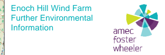
Figure 8.1 Shadow Flicker Study Area