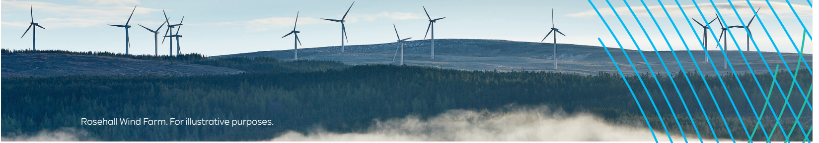
Rosehall Wind Farm. For illustrative purposes.