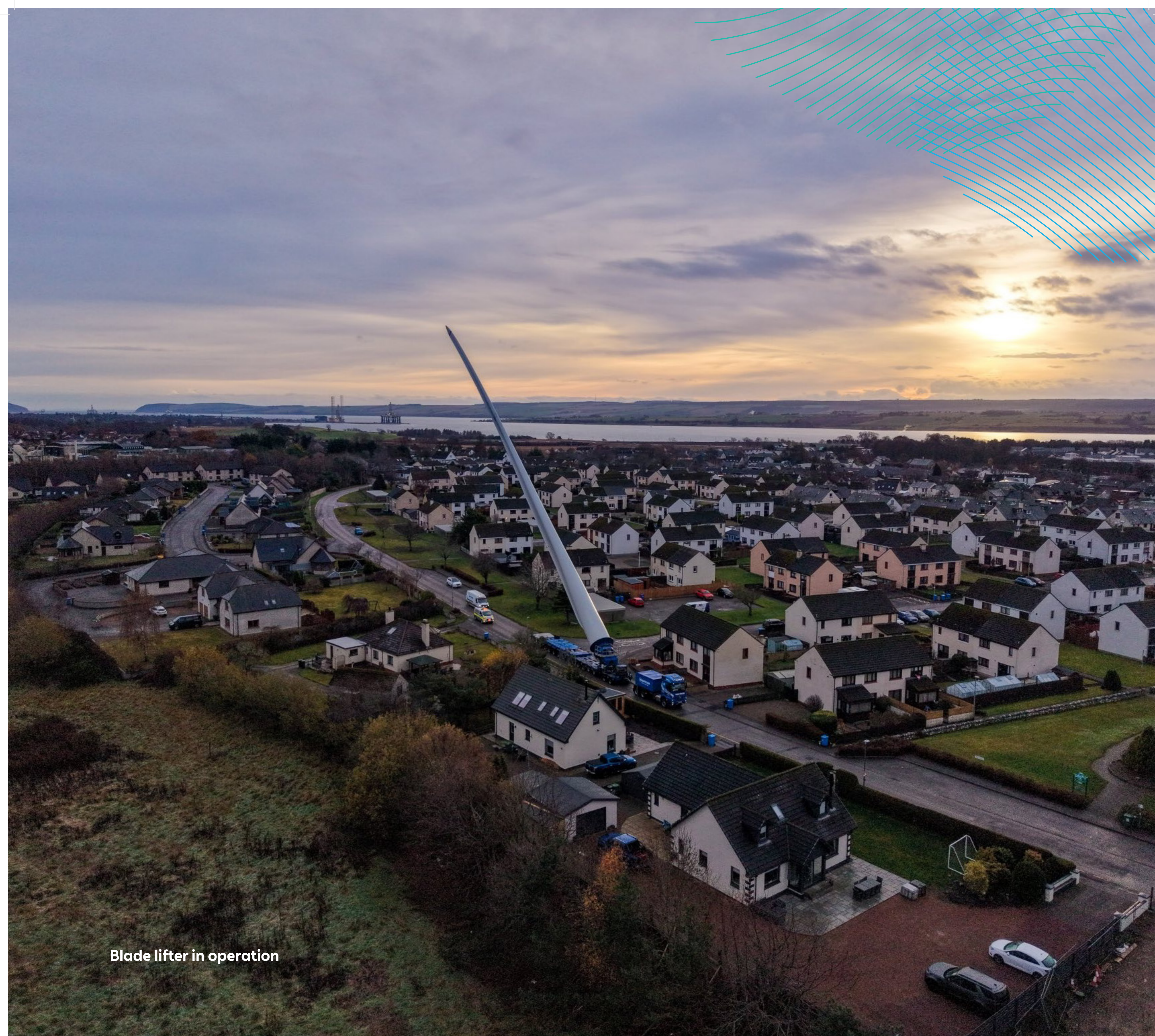
Blade lifter in operation