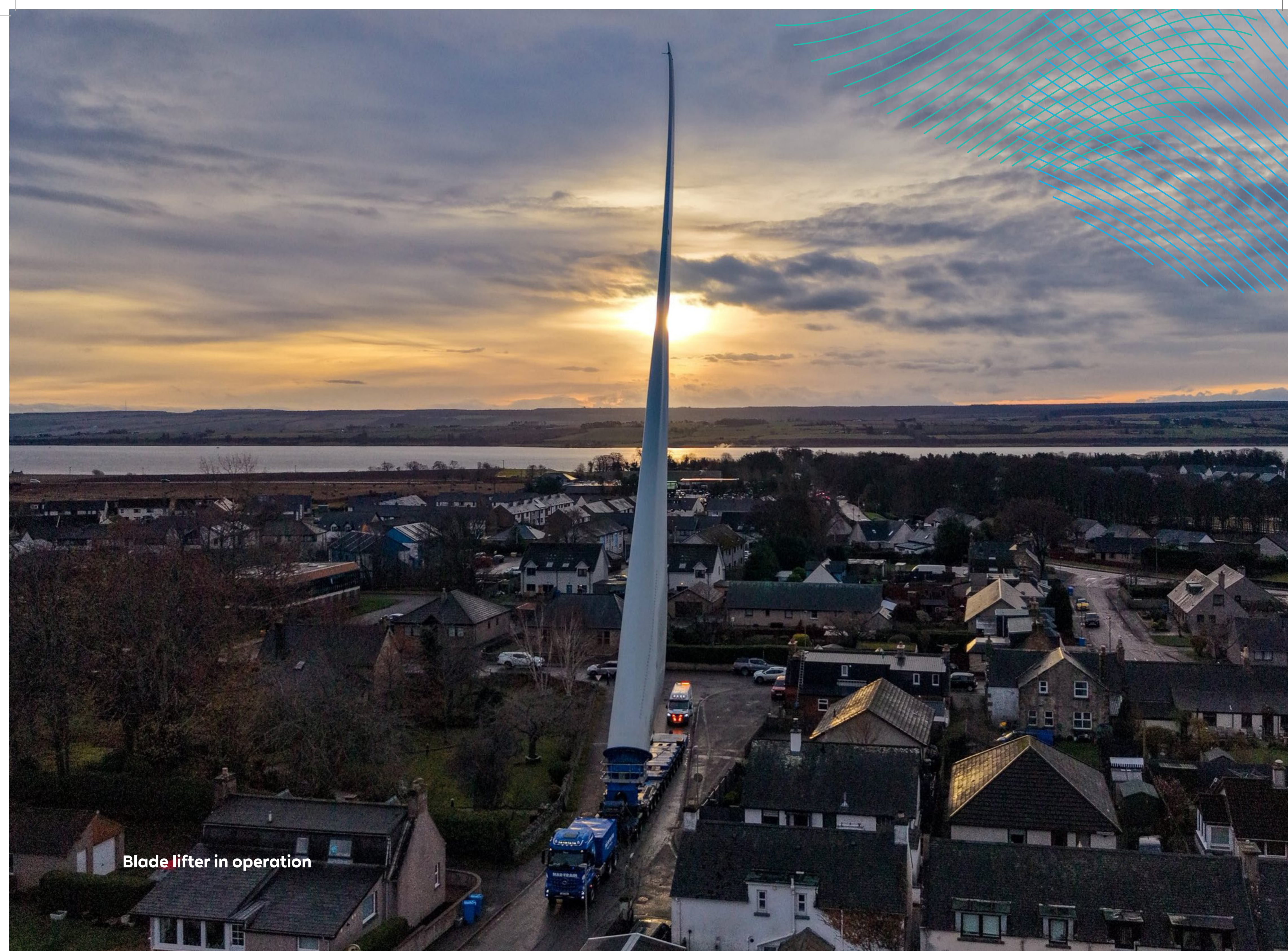
Blade lifter in operation