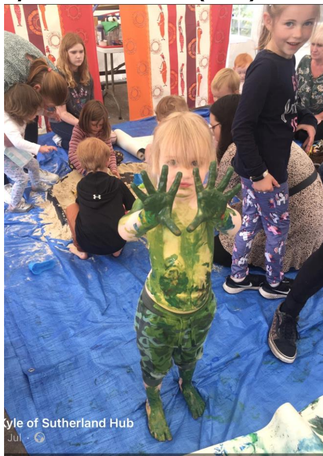
Messy play at the Hub!

In February 2022 KSoH received £3,000 towards core running costs including staff