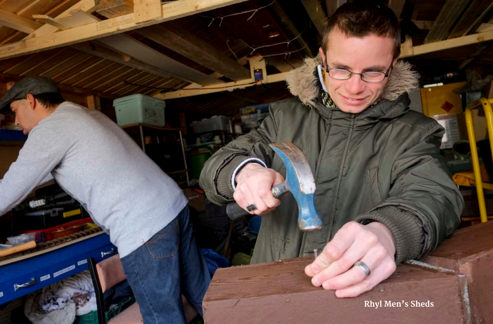
Rhyl Men's Sheds