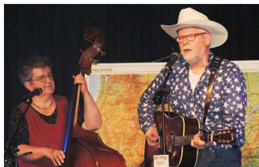
North Wales Bluegrass Festival