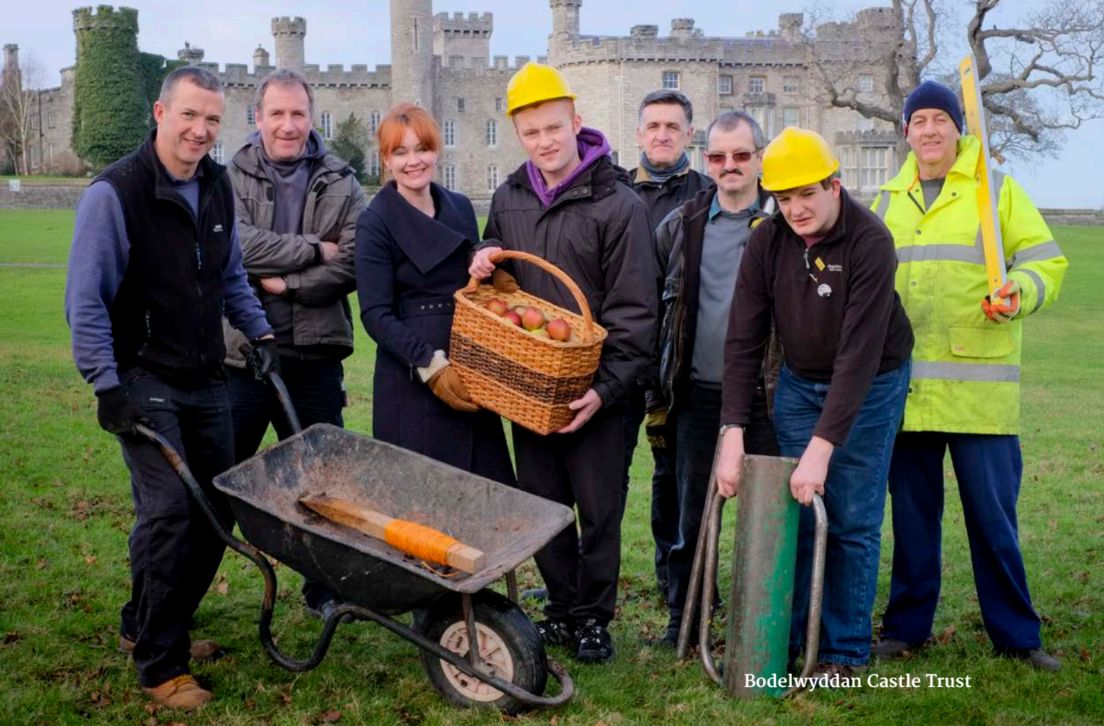
Bodelwyddan Castle Trust