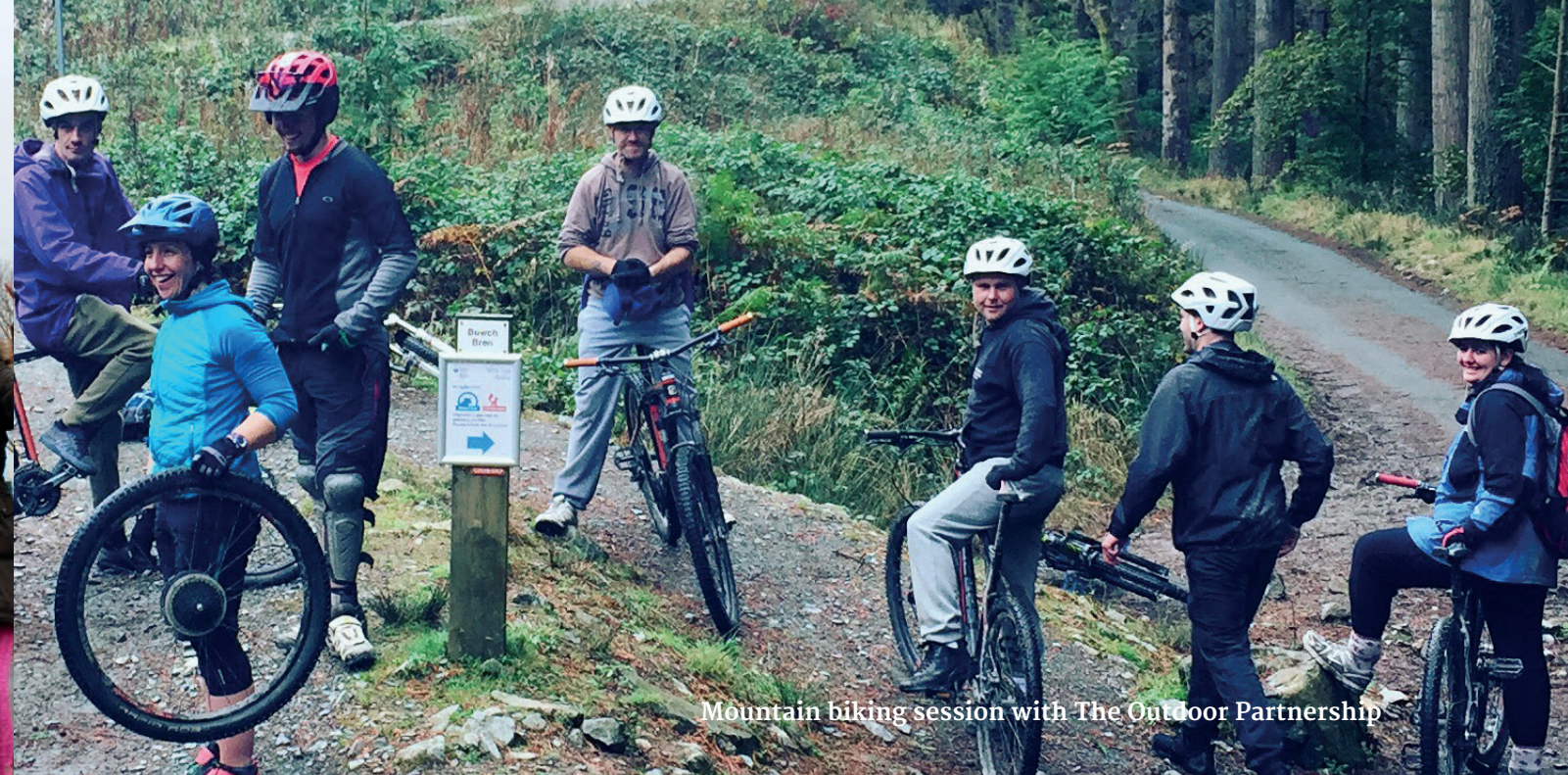
Mountain biking session with The Outdoor Partnership

The Outdoor Partnership project is a 5 year collaboration between the Outdoor Partnership and North Wales Housing Association (NWAHA) to deliver a targeted programme of outdoor activities to increase employment and volunteering opportunities. The project aims to remove participation barriers for low or no income families and provide high quality outdoor adventure experiences to raise confidence, motivation, health and well-being and improve essential work-based skills required by employers in the outdoor sector.