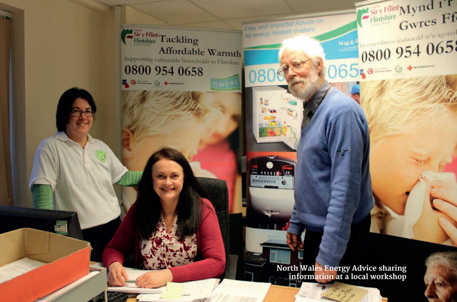
North Wales Energy Advice sharing information at a local workshop