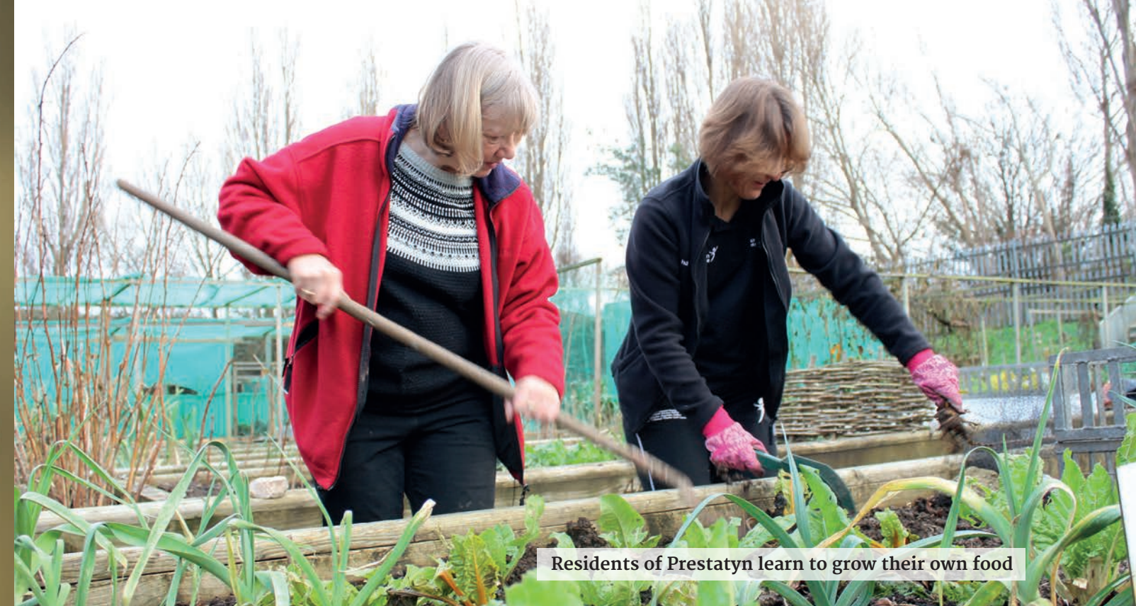
Residents of Prestatyn learn to grow their own food