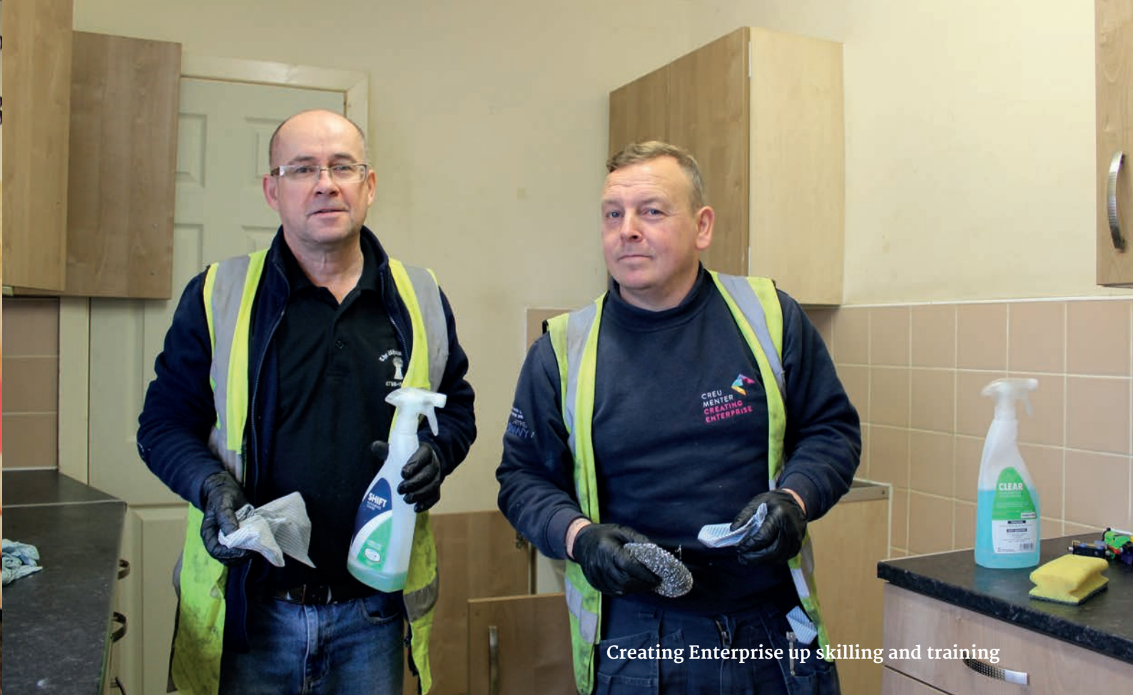
Creating Enterprise up skilling and training