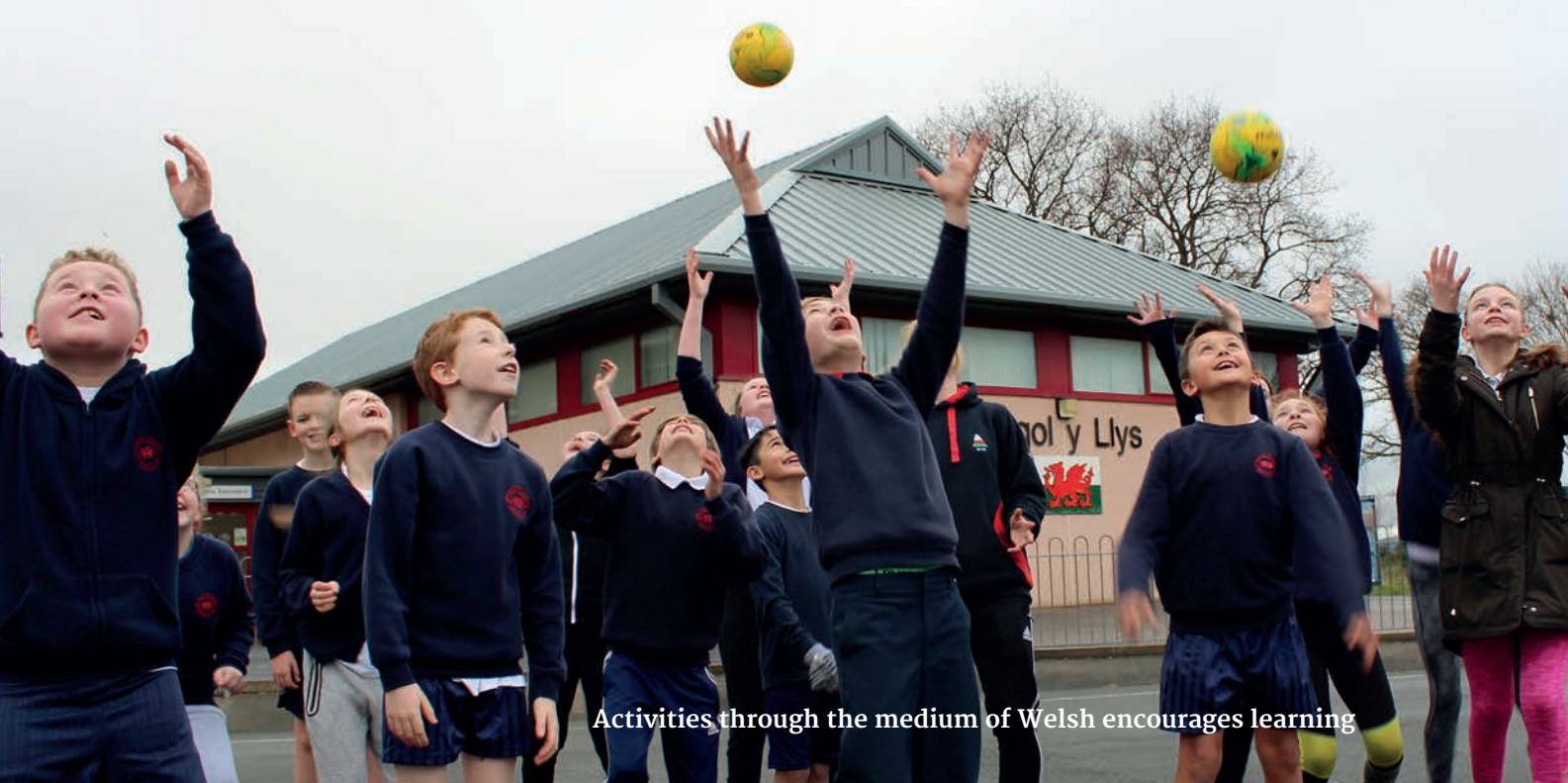
Activities through the medium of Welsh encourages learning