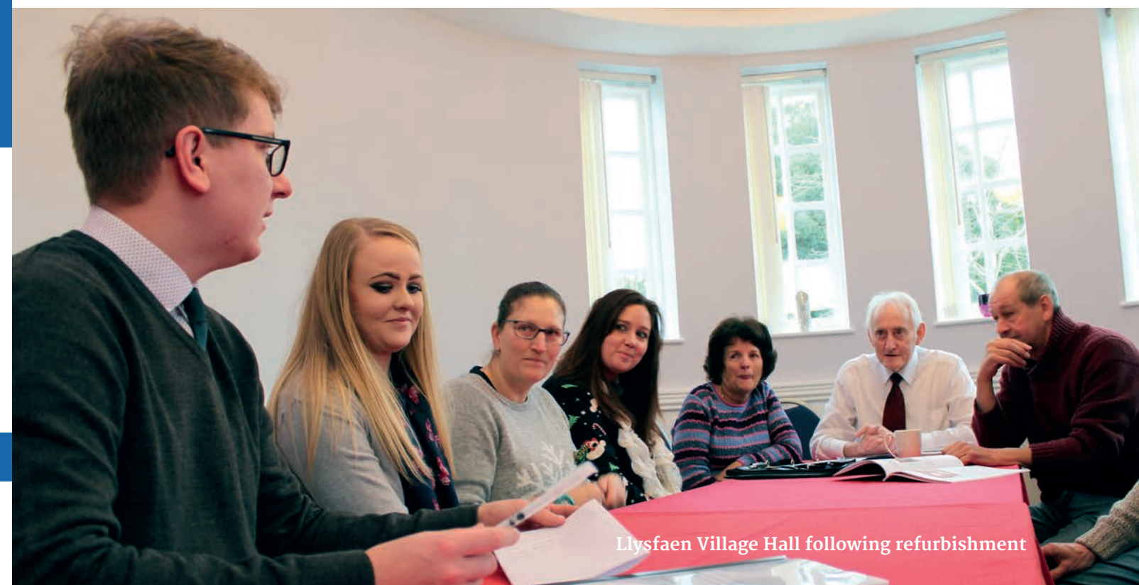
Llysfaen Village Hall following refurbishment