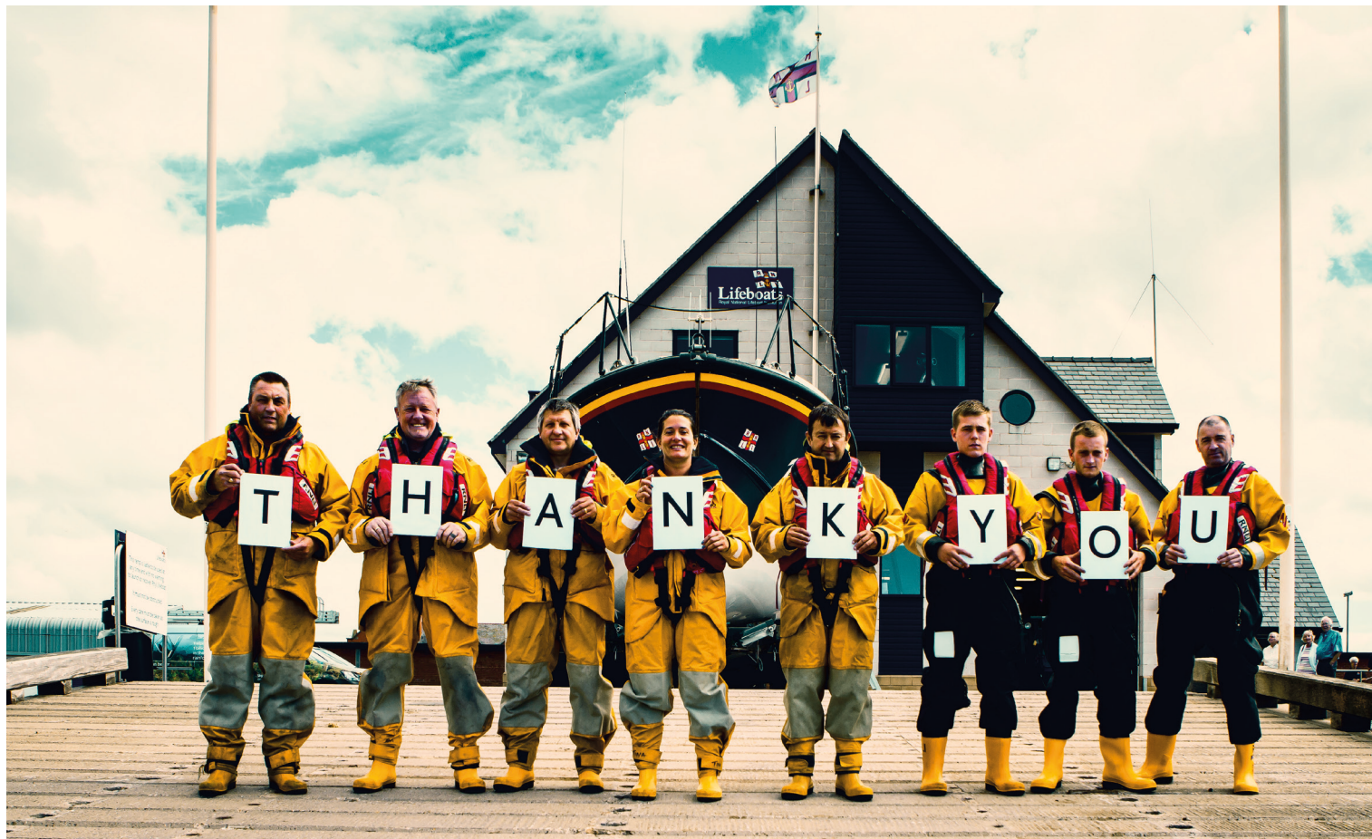
Above: Members of Rhyl lifeboat crew outside the boathouse